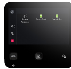
5-inch colour touch panel