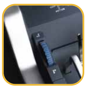
Adjustable edge guide aligns sheets accurately