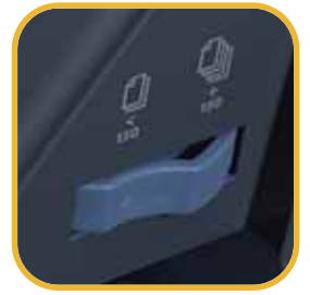
Back margin adjustment selector for various sheet sizes