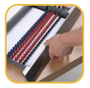
Front access full size storage tray for materials and documents