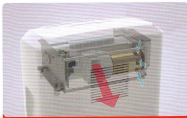
Patented cooling technology