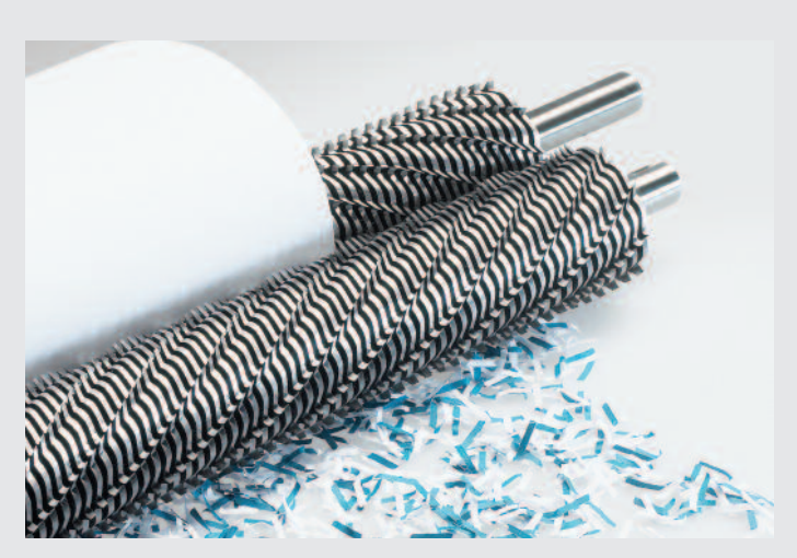
Robust and durable: High-quality paper clip proof cutting shafts from special hardened steel. Lifetime guarantee on the cutting shafts under conditions of fair wear and tear.