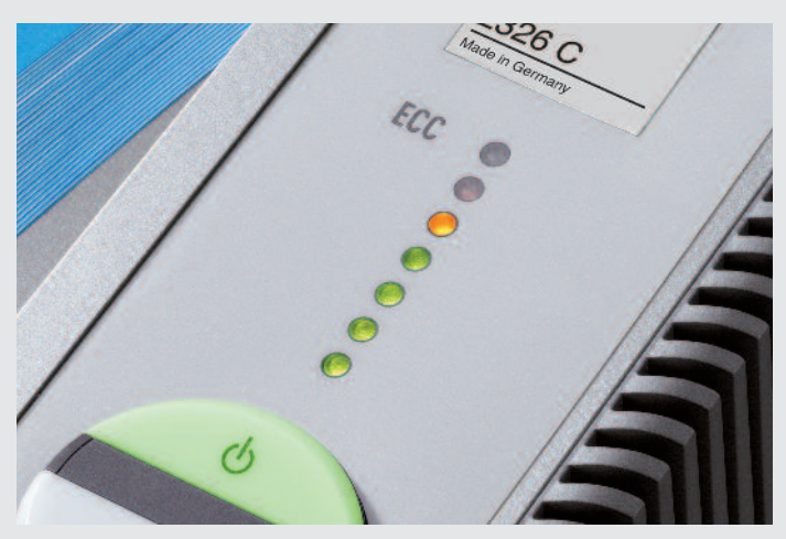
ECC Electronic Capacity Control – LEDs indicate the used sheet capacity during the shredding process to avoid paper jams.