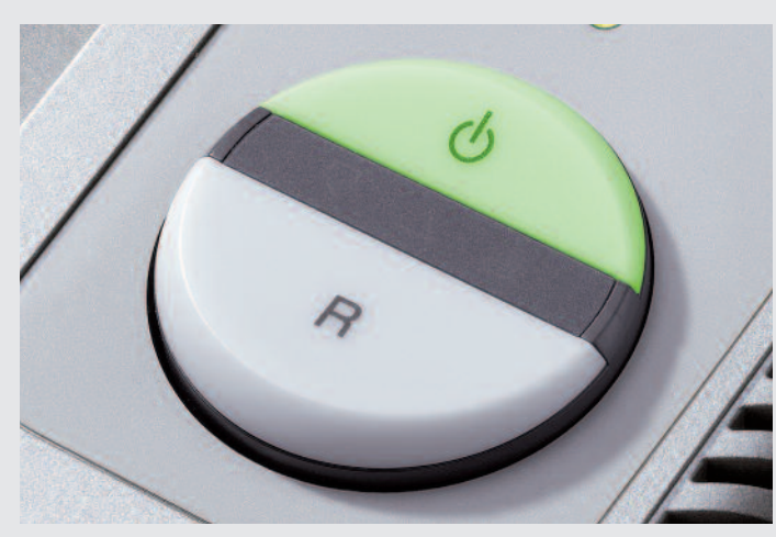
EASY-SWITCH: intelligent multifunction switch element with integrated optical signals for the operational status of the shredder.