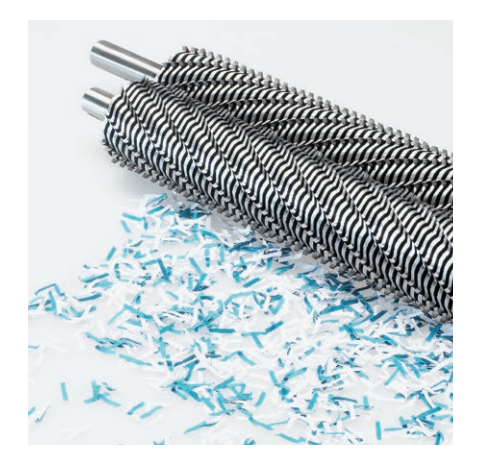
SOLID STEEL CUTTING SHAFTS

Robust and durable: high-quality paper clip proof cutting shafts with lifetime guarantee under conditions of fair wear and tear.