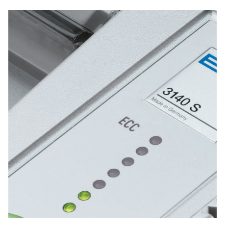
ECC – ELECTRONIC CAPACITY CONTROL This electronic feature indicates the used sheet capacity during shredding process to avoid paper jams.

Ease of operation: intelligent multifunction switch element with integrated optical signals indicating the operational status. Additional "emergency switch" function.