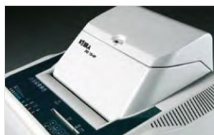
LOCKABLE COVER (LK)