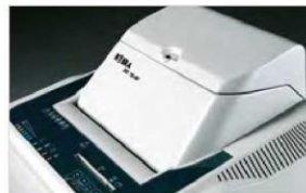
LOCKABLE COVER (LK)

It can shred automatically 170 sheets, whilst the operator can shred paper in the main throat and CDs/DVDs/Credit through the dedicated cutting unit, at the same time.