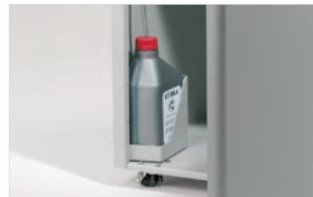
AUTOMATIC OILING SYSTEM