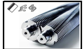
+C CARBON HARDENED STEEL CUTTING KNIVES