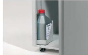
AUTOMATIC OILING SYSTEM

The lockable cover protects top-secrets or confidential documents waiting to be shredded when the shredder is left unattended. It is supplied with high security non-duplicable key.