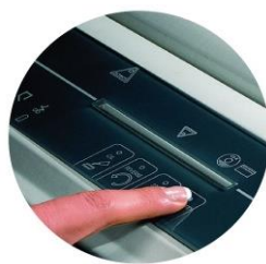
輕觸面版及LED顯示 自動、停止、前進、退回 LED 顯示機器狀況 · 簡潔清楚